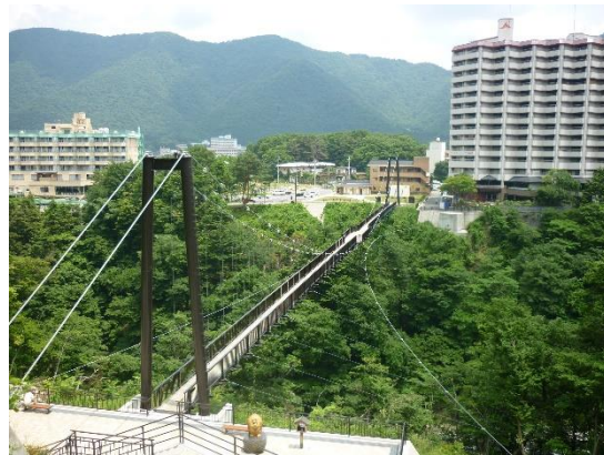
Kinu-Tateiwa Suspension Bridge

※ Please note that the event organizers cannot be held responsible for any accidents, theft, or other incidents occurring in the temporary parking areas. Please exercise sufficient caution.