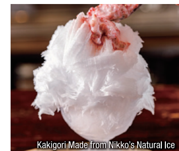
Kagigori Made from Nikko's Natural Ice