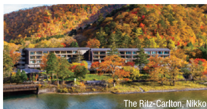
The Ritz-Carlton, Nikko