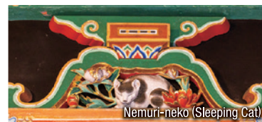
Nemuri-neko (Sleeping Cat)

These three sacred sites, known as “the Shrines and Temples of Nikko,” were recognized for their historical and cultural significance and designated as a UNESCO World Heritage Site in 1999. Today, they continue to attract visitors from all over the world.