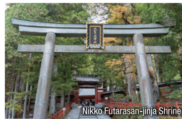
Nikko Futarasan-jinja Shrine