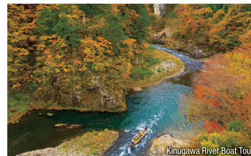
Kinugawa River Boat Tour

Nikko's seasons bring vibrant and dramatic transformations. In spring (late March to early May), cherry blossoms bloom across the region, with opportunities to enjoy illuminated nighttime sakura. Summer (June to August) blankets the mountains in lush greenery, providing ideal conditions for adventure activities. Autumn (September to November) is particularly renowned for its spectacular autumn foliage, creating mesmerizing scenery. Winter (late December to February) welcomes snow activities, and the illuminated snowy landscapes at night offer an enchanting experience.