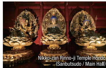
Nikko-zan Rinno-ji Temple Hondo (Sanbutsudo / Main Hall)