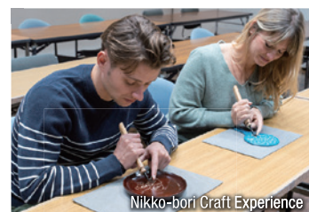
Nikko-bori Craft Experience

For those eager to explore Nikko's rich history and culture, joining a guided tour led by local experts around the World Heritage sites is highly recommended. You can also try your hand at Nikko-bori, a traditional woodcarving craft representative of Nikko, with roots tracing back to the artisans who worked on the carvings of Toshogu Shrine. Experience the intricate craftsmanship firsthand and create your own Nikko-bori piece as a special keepsake from your journey.