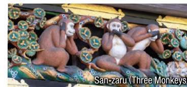
San-zaru (Three Monkeys)