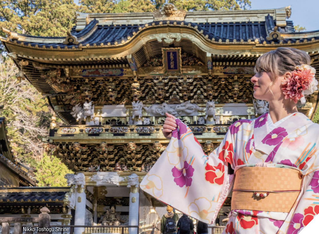
Nikko Toshogu Shrine