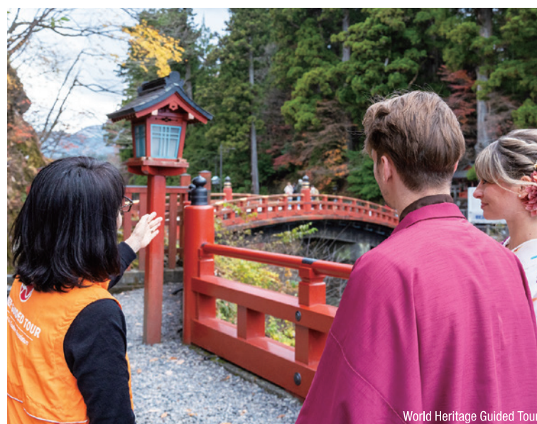
World Heritage Guided Tour