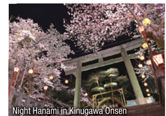
Night Hanami in Kinugawa Onsen