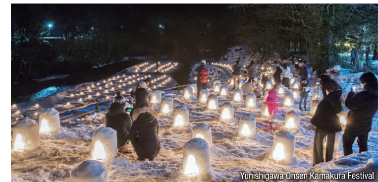
Yunishigawa Onsen Kamakura Festival