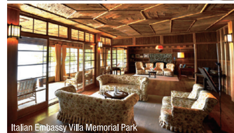
Italian Embassy Villa Memorial Park