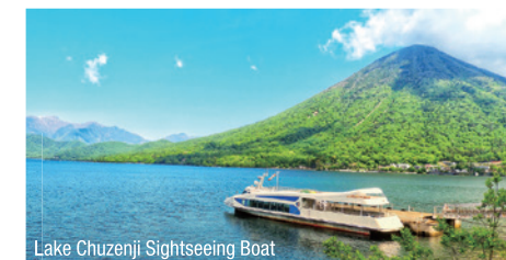
Lake Chuzenji Sightseeing Boat