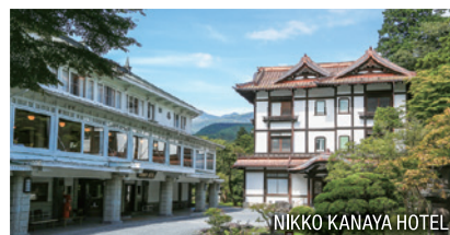
NIKKO KANAYA HOTEL

In the modern era, Nikko's breathtaking nature and rich history caught the attention of Western visitors, establishing the area as a popular summer retreat. In 1873, NIKKO KANAYA HOTEL, Japan's oldest Western-style resort hotel, opened its doors, and Okunikko soon became dotted with vacation villas belonging to foreign diplomats. Many of these historic landmarks remain and can be seen today. Continuing its legacy as an international resort, the city welcomed The Ritz-Carlton, Nikko in 2020, further cementing its status as a world-class travel destination.