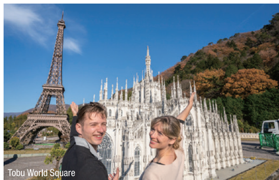
Tobu World Square

Beyond historic sites and breathtaking nature, Nikko offers plenty of fun activities to enjoy with your family and friends. At Edo Wonderland Nikko Edomura, where the streets of the Edo period are recreated, transform yourself into a samurai or ninja, while Tobu World Square showcases miniature replicas of world-famous landmarks, perfect for capturing unique photos. Additionally, you can experience seasonal activities such as skiing, snowshoeing, and strawberry picking during the winter months.