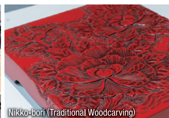
Nikko-bori (Traditional Woodcarving)