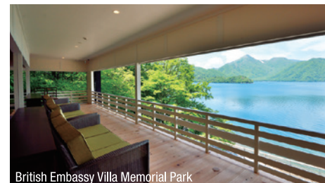
British Embassy Villa Memorial Park