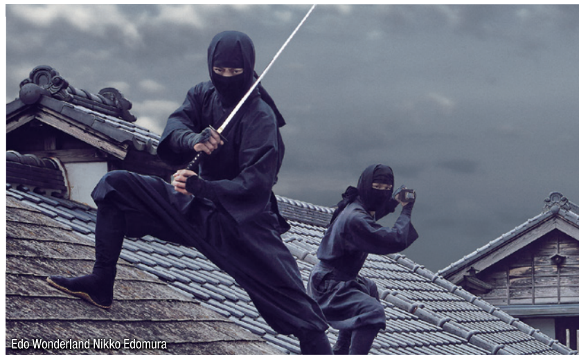
Edo Wonderland Nikko Edomura